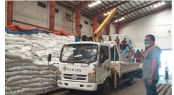
Bolo Warehouse WSII Reggie Dorado supervises the release of 750 bags of NFA rice to the City Government of Roxas.

With the high demand for rice, NFA Capiz was authorized to mill 230,000 bags of its palay stocks or a rice equivalent of 144,900 bags of well milled rice that commenced in mid-April 2020 to augment its rice stocks.