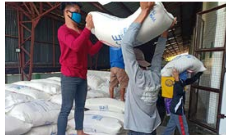
CONTINGENCY MEASURE. A total of forty one thousand three hundred seventy six (41,376) bags were issued to the different local government units in the province of Ilocos Norte as of June 30. Rice issuances to LGUs is one of the contingency measures during the Covid-19 pandemic.