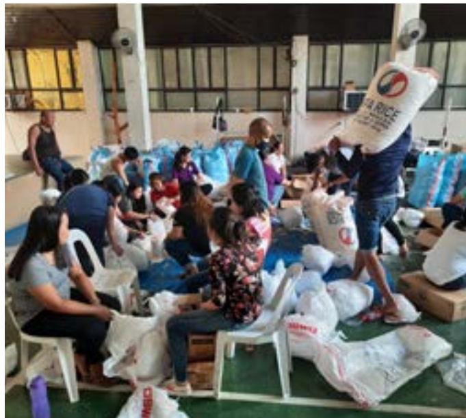
Repacking of rice at the Farmers Event Center at NFA Capiz by DSWD