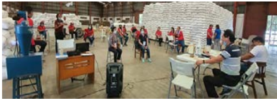
QAOs and WS-II during the re-orientation/briefing

The first batch was held at the NFA-Valencia warehouse participated in by NFA-Bukidnon QAOs and