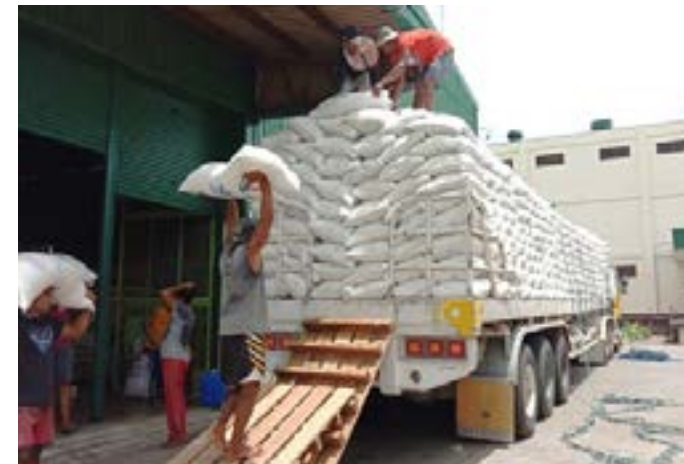
RICE CARAVAN. Bags of rice are loaded to trucks at NFA-Kalinga warehouse as part of the rice caravan from Region II to augment the rice requirements of NCR during the ECQ due to COVID-19.