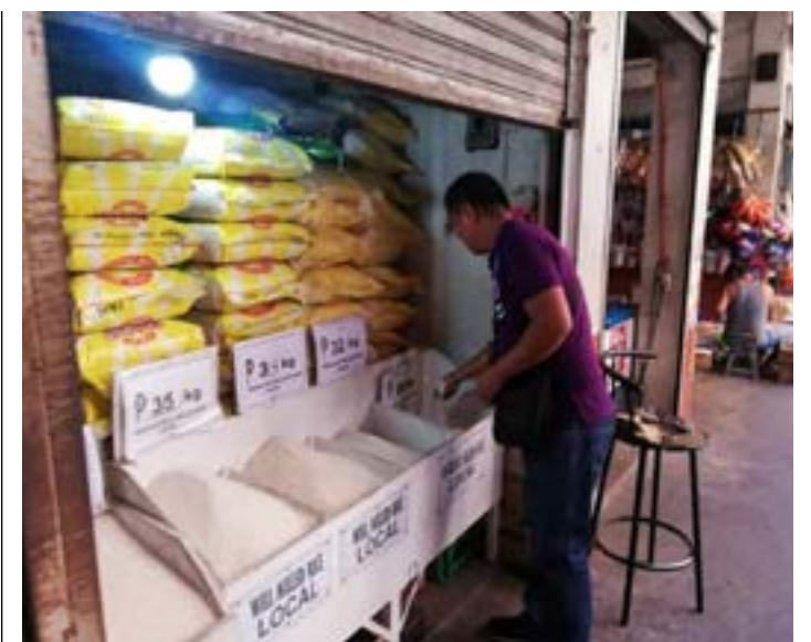
MARKET MONITORING. Amid COVID-19, NFA Ilocos Sur personnel conduct rice price and supply monitoring in selected major markets in the province as part of the OPCEN Situational Report during the ECQ.