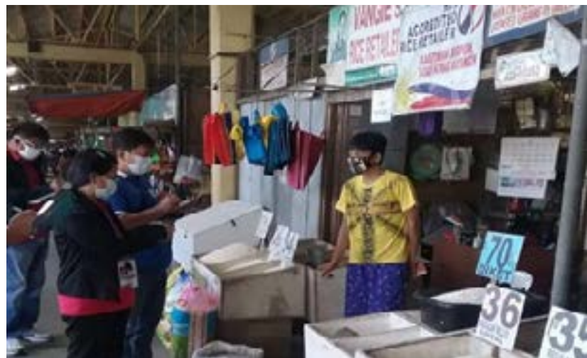
PRICE FREEZE MONITORING. The NFA and representatives from the Department of Trade and Industry (DTI) Ilocos Norte Provincial Office, Department of Agriculture (DA), and the National Bureau of Investigation (NBI) conducts an on-site monitoring of prices of basic necessities and prime commodities during the Enhanced Community Quarantine in the province to make sure that price freeze is being implemented. Said monitoring was done in various establishments in Laoag City, San Nicolas and Batac City on March 20, 2020.