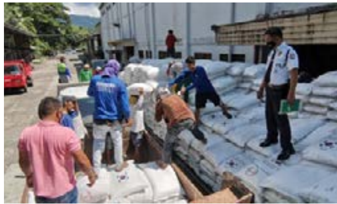
Arrival of 1,500 bags allocation of rice donation of Korea at NFA Nueva Vizcaya.

A total of 1,500 bags were distributed to the affected families in Nueva Vizcaya, 600 bags for the province of Quirino, 3,750 bags for the province of Isabela and 2,900 bags for Cagayan province.