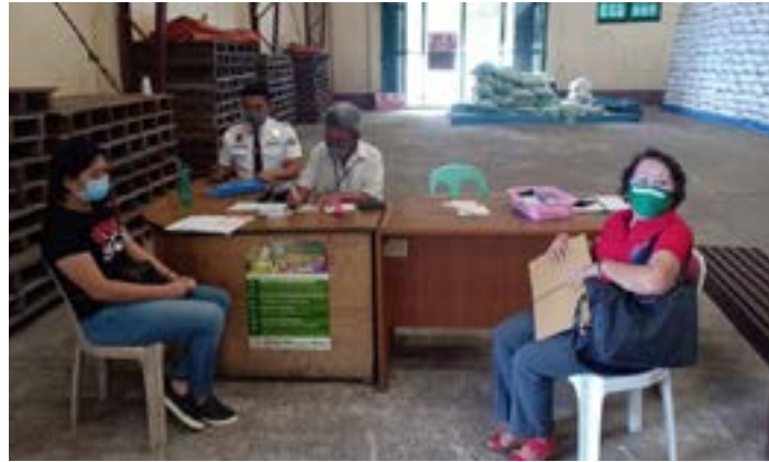
COVID-19 RICE DISTRIBUTION. NFA Bohol caters to the rice purchases of various LGUs for stock prepositioning and provision of family food packs to their residents whose livelihood were directly affected due to the suspension of work and business operation during the province-wide community quarantine.