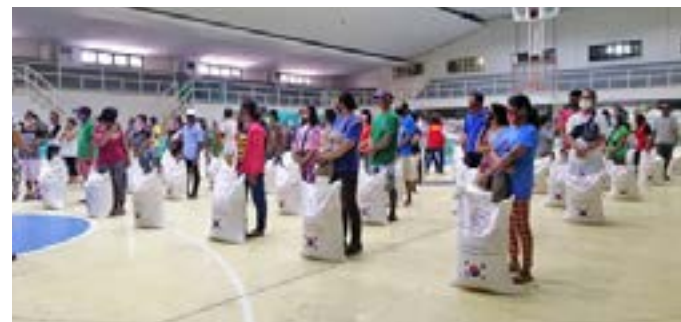
Beneficiaries from LGU Mallig, Isabela received their rice donation from APTERR.