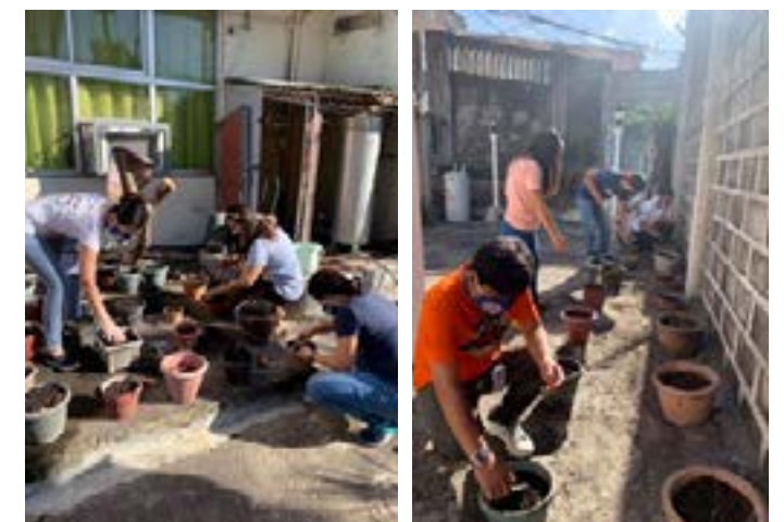
NFA-Region V employees planting seeds in the pots

The activity proved how determined and motivated the employees were to participate and comply with the Plant, Plant, Plant Program of the government thru the Department of Agriculture.