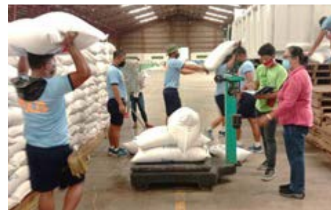
RICE ISSUANCE. NFA-Kalinga issues 240 bags to DSWD-CAR with the help of the Philippine National Police of Tabuk City (left photo) while the Municipality of Tanudan withdraws 1,000 bags, intended for relief operations during the COVID-19 lockdown in the province.