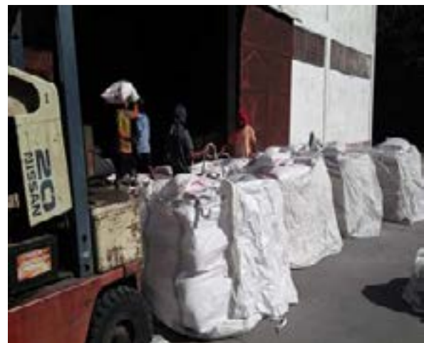
Rice stocks in tonner bags are being loaded to a hauling truck for transport to PPA, Makar Wharf, Gensan in a 24-hour operation