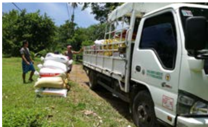
The truck lends by the Department of Agriculture to NFA.