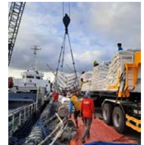
Local rice being transferred from trucks to MV Cecilia V