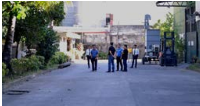
The proposed location of the 80-ton truck scale to be installed at EDO replacing the 60-ton truck scale which will eventually be transferred to Cavite Provincial office.