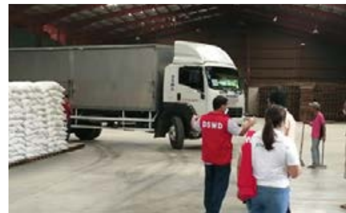
NFA employees assist DSWD officials during the withdrawal of rice donated by Korea at NFA Warehouse in Cagayan.