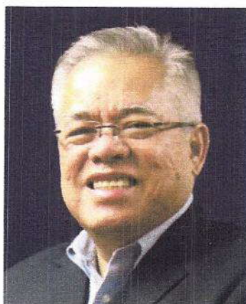
Ramon M. Lopez Secretary Department of Trade and Industry

He started a solid professional economic, trade and industry development career in government from (1981-1993). Presidential Management Staff (1981), the Department of Trade and Industry (1982-1989) and NEDA (1989-1993). He has extensive experience in trade and industry development planning, at the forefront of the Tariff Reform Program, Industry development programs, setting up of ASEAN and APEC cooperation programs, technical studies on Countervailing Duty cases, critical consumer products' price structures and the development of the Foreign Investment Act. This included policy and program development, and project evaluation functions.