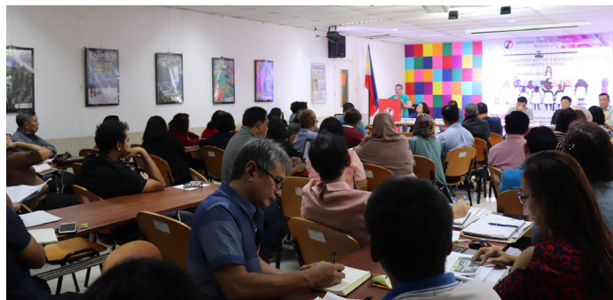
Participants during the workshop composed mostly of employees from regions 9 to 12, 14 and 15