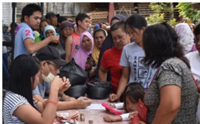
Bigasan sa NFA Basilan compound in coordination with Basilan GRECON.

The public strongly felt the presence of NFA through our continuous effort in mitigating the effects of rice shortage by ensuring that the cheap good quality NFA rice is visible to our consumers. (JELLA MAE L. SALVADOR, correspondent)