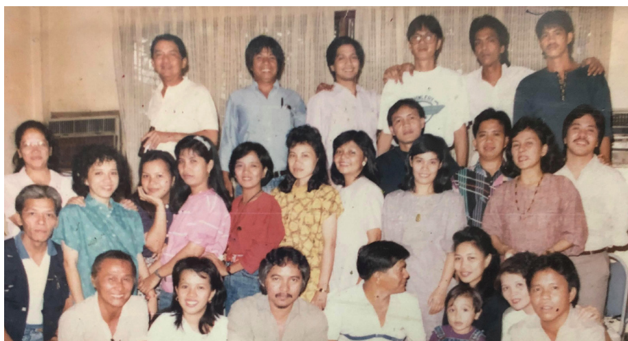
It used to be called the Public Affairs Office (PAO) where there were more than 100 staff in its stable. It was renamed Directorate for Public Affairs and later as Dept for Public Affairs. Public Affairs Dept now has 14 personnel .

As the law took effect on March 5, 2019, its self-executing provisions had to be implemented. Among these are the repeal of NFA's regulatory functions: