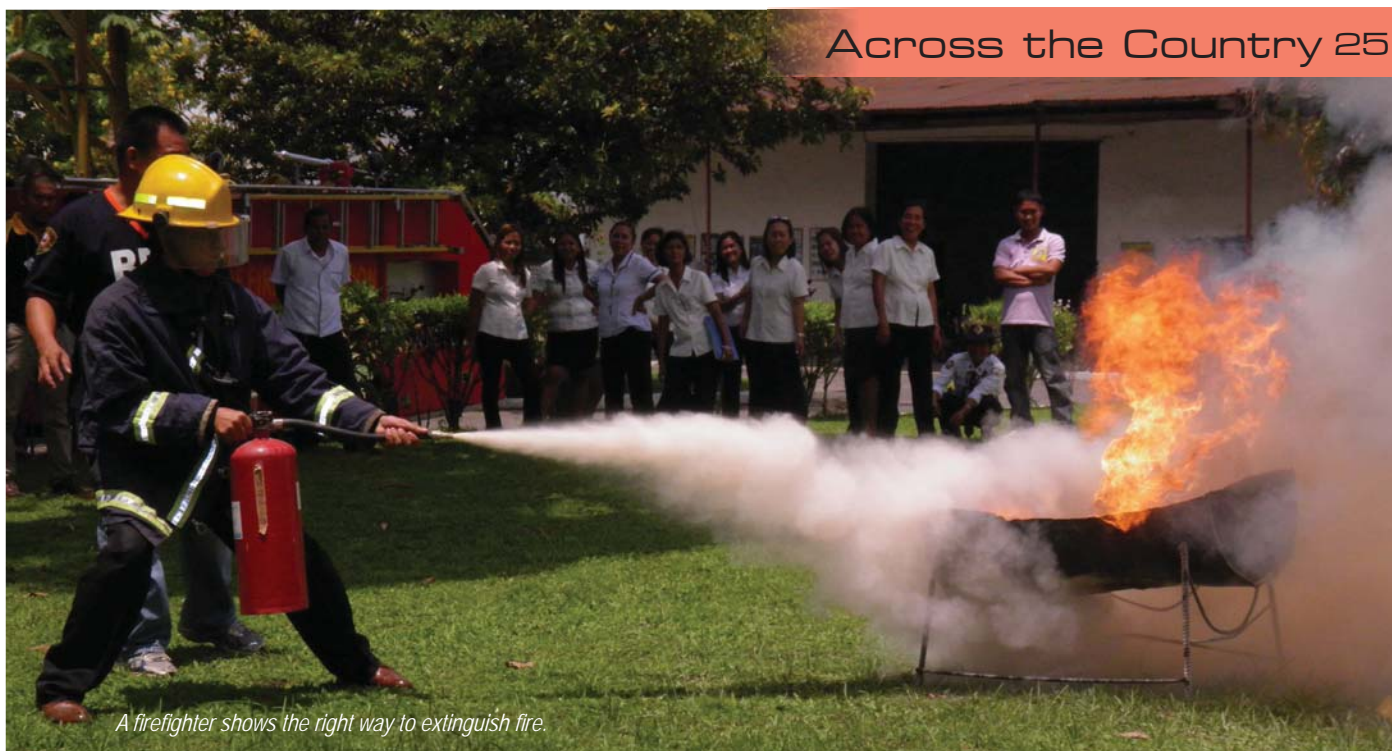
A firefighter shows the right way to extinguish fire.