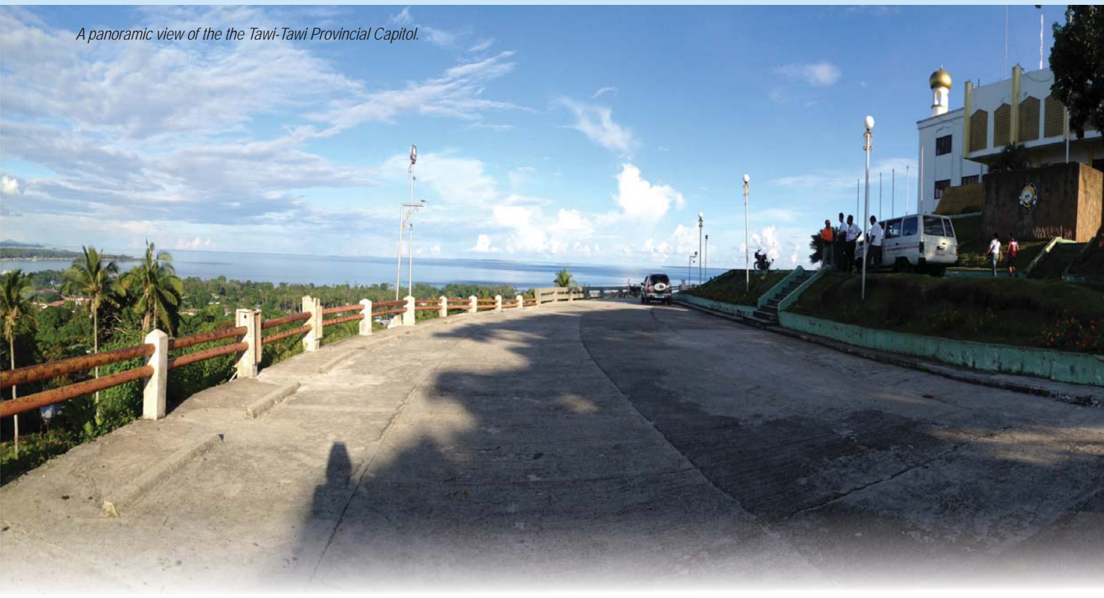
A panoramic view of the the Tawi-Tawi Provincial Capitol.

are practicing nurses in Saudi Arabia. A son is currently taking up dentistry in Manila while the youngest child is on his third year in college taking up Hotel and Restaurant Management (HRM). "It makes me happy seeing that my children