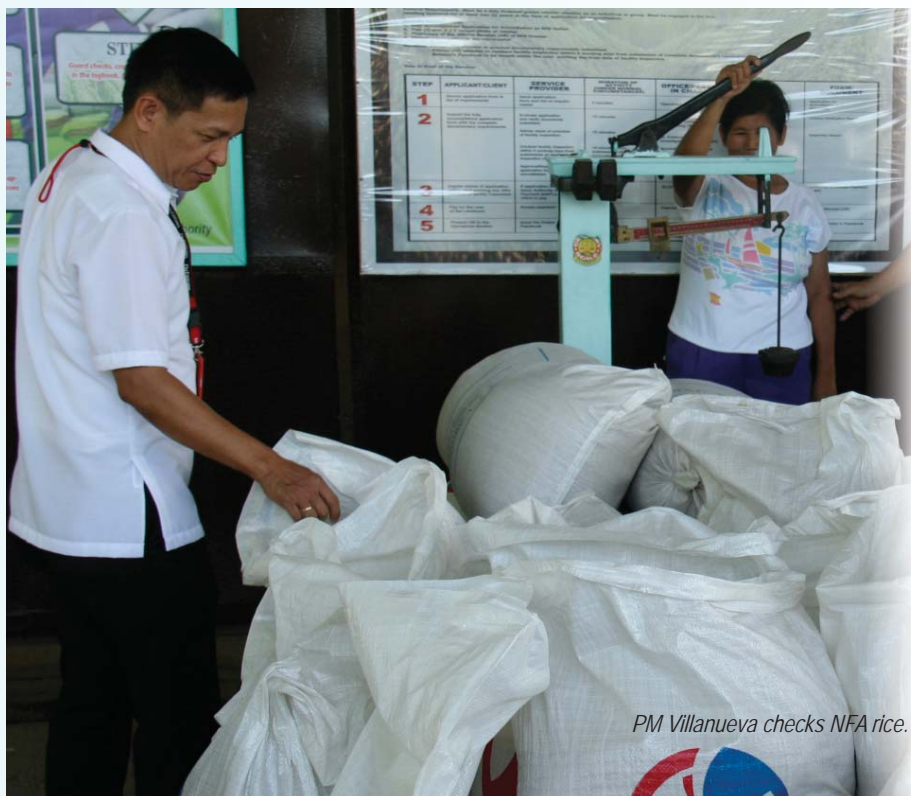
PM Villanueva checks NFA rice.

Per NFA classification, Quirino was previously a class C province because it lacks the necessary processing facilities. But PM Manny was able to upgrade the provincial office into class B when he was able to facilitate the rehabilitation of the rice mill previously installed in Alfonso Lista which is now being utilized at GID warehouse in San Marcos Cabaroguis with 70 bags rice output per day for an eight-hour operation. Currently, he is also instrumental in installing the perimeter fence of our FLGC in Sagguday and Maddela utilizing used galvanized roofs when the FLGC in Sagguday was re-roofed.