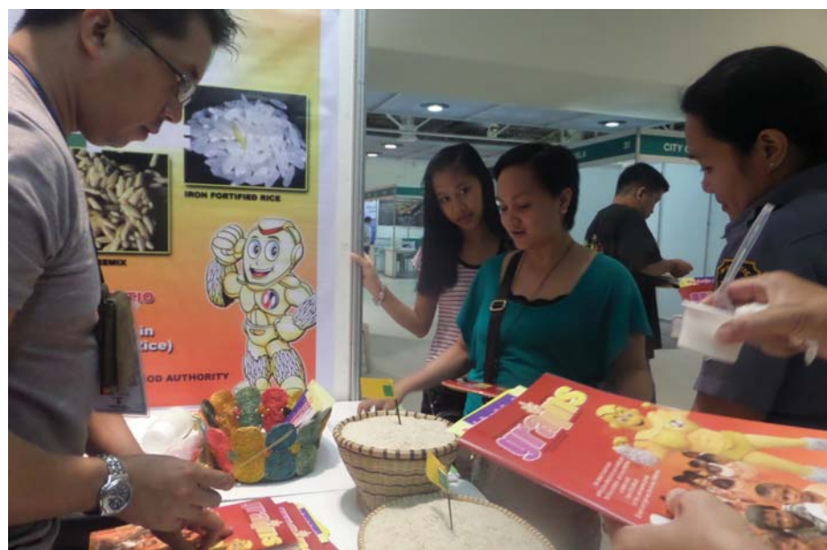
Mallgoers visit the NFA booth during the 2013 KABISIG Trade Expo

Services Department (TRSD) both in Central Office and the South District Office (SDO) in NCR. The contingent took part