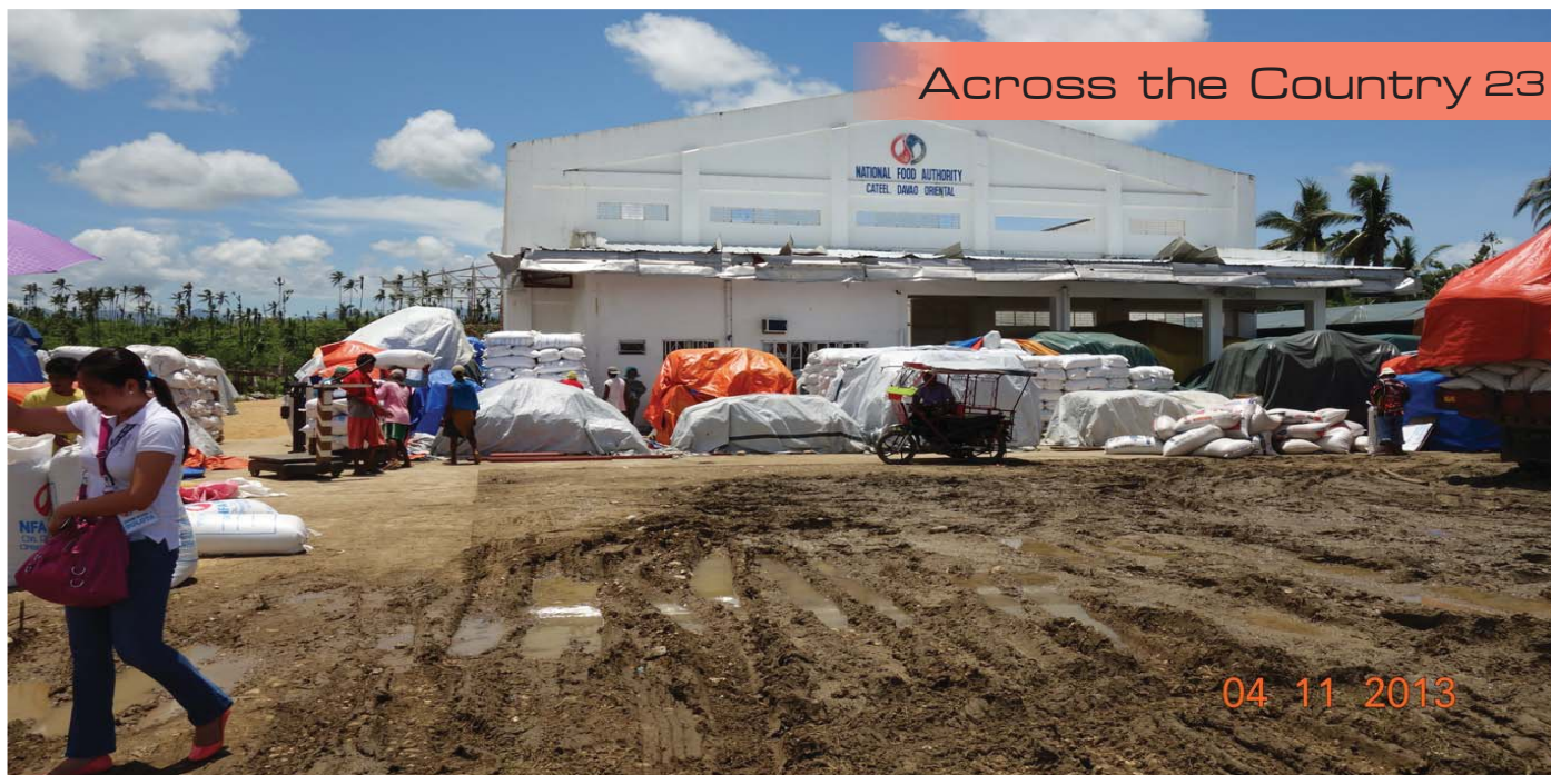
WEIGHING. Palay stocks are weighed outside this warehouse in Cateel, Davao Oriental. Wet palay are transferred to the Banaybanay warehouse.