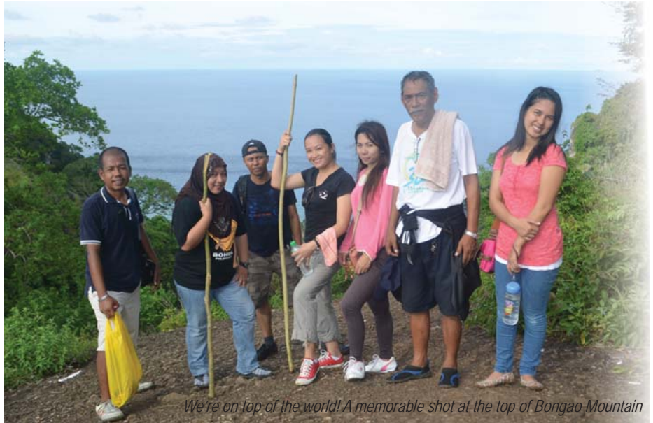
We're on top of the world! A memorable shot at the top of Bongao Mountain