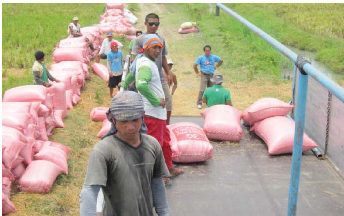
FARMERS IN WAITING. Farmers await their turn to sell their produce in Carmen, Davao del Norte.