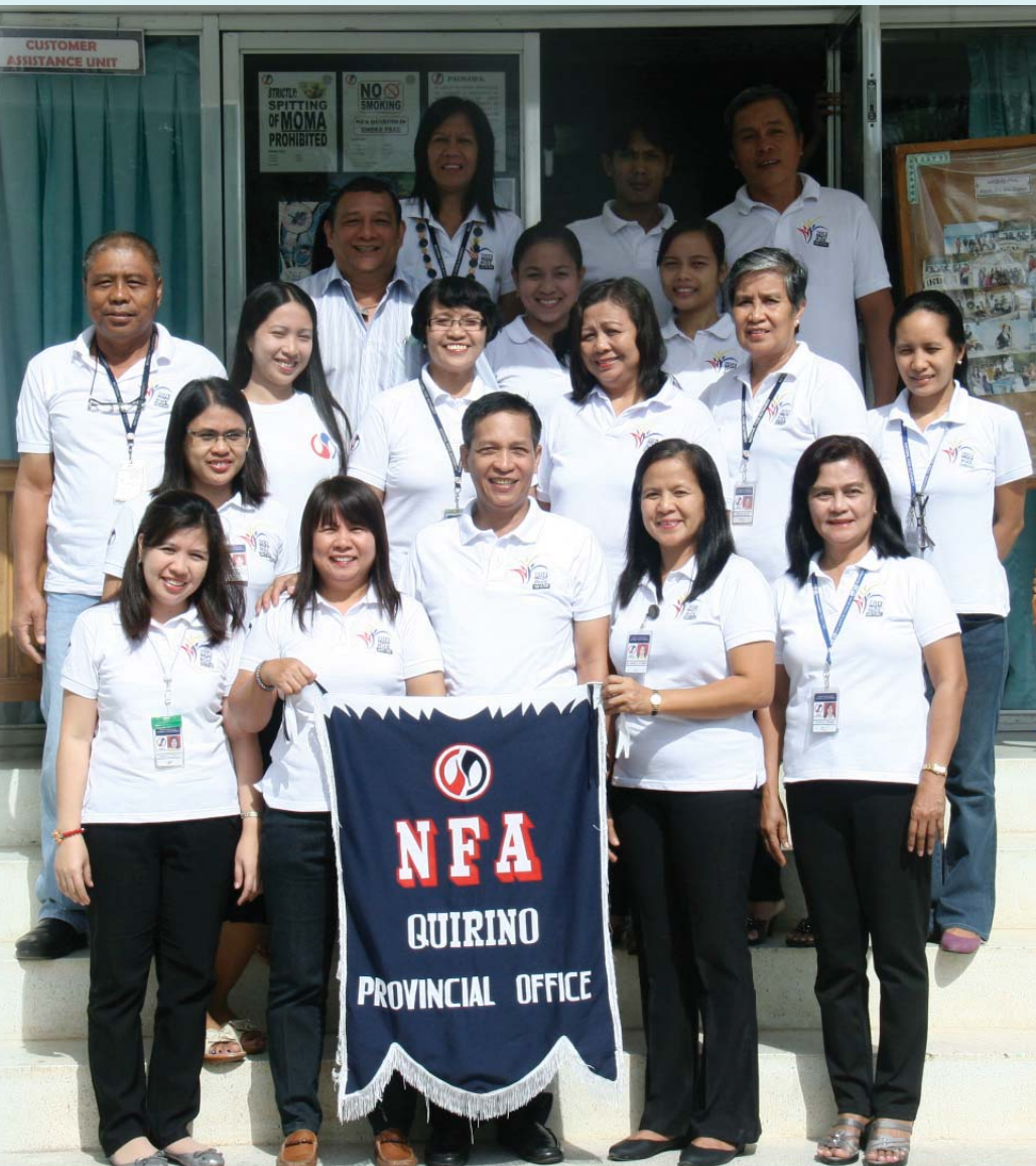
NFA Quirino employees