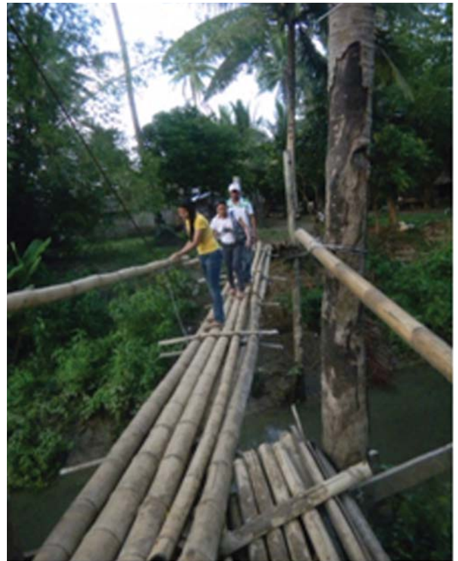
The NFA procurement team crosses a hanging bridge to buy palay directly from farmers.

NFA Naval surpassed its target for the month of March and April 2013.