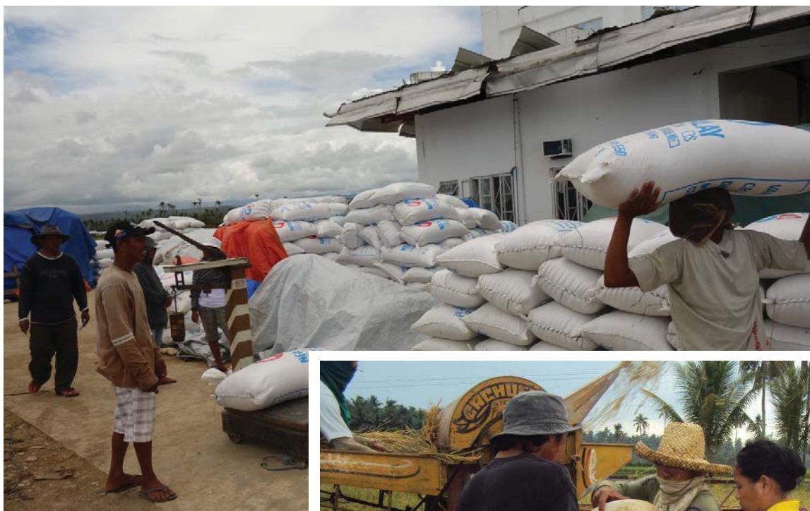
PILES OF PALAY. Palay stocks are piled outside "Pablo" ravaged warehouse/buying station in Cateel, Davao Oriental.

CDIF accounts active this could be done through palay deliveries to NFA. They will be notified concerning their CDIF balances.