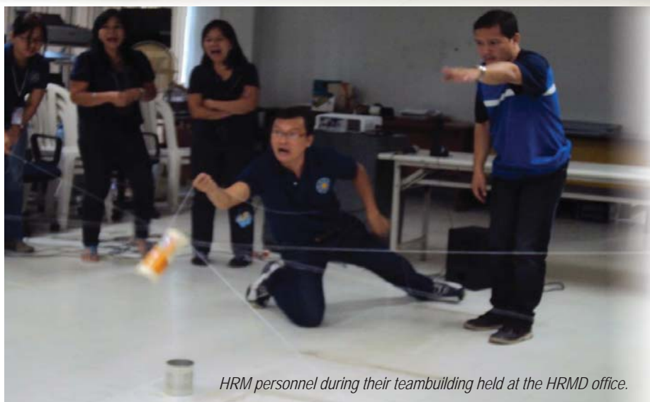
HRM personnel during their teambuilding held at the HRMD office.

The main objective of the structured team building activities is to increase overall organizational effectiveness by improving the quality of existing working relationships, intensifying team building and creating common awareness of the organization and direction.