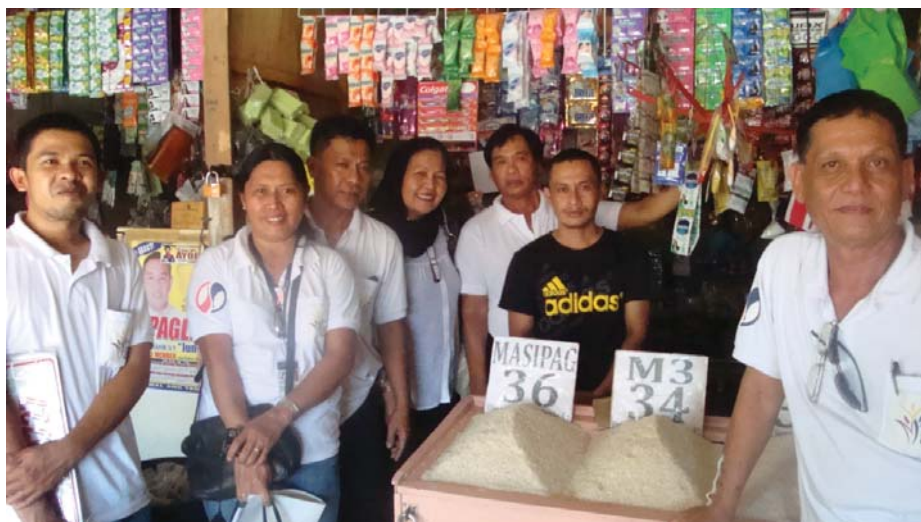
The mobile licensing and market inspection team.