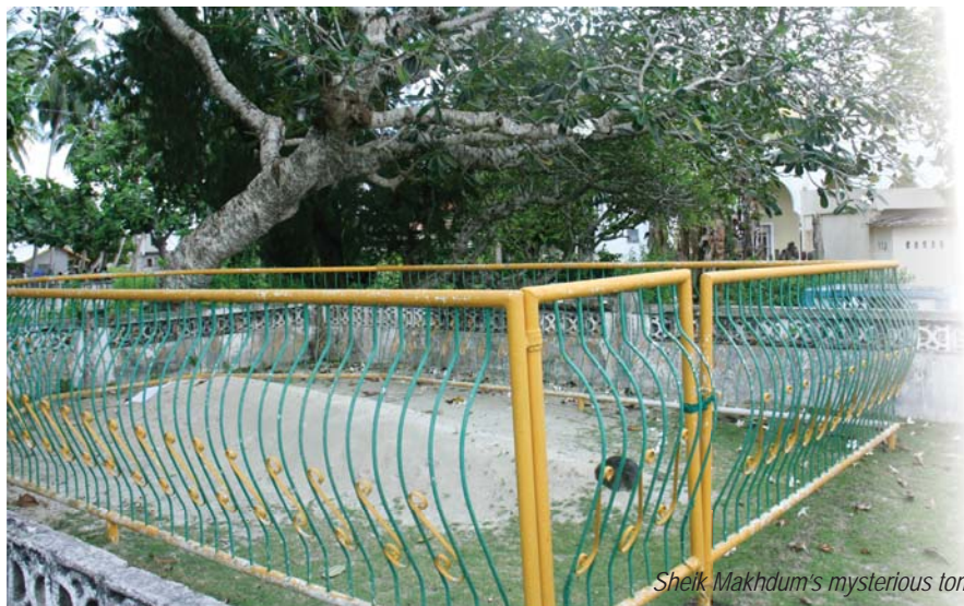
Sheik Makhdum's mysterious tomb.