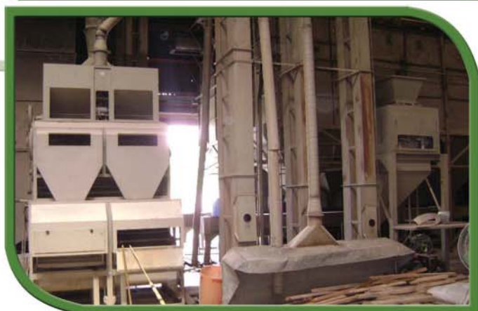
A mechanical dryer at a warehouse in Allacapan.