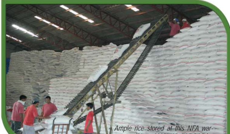
Ample rice stored at this NFA warehouse.