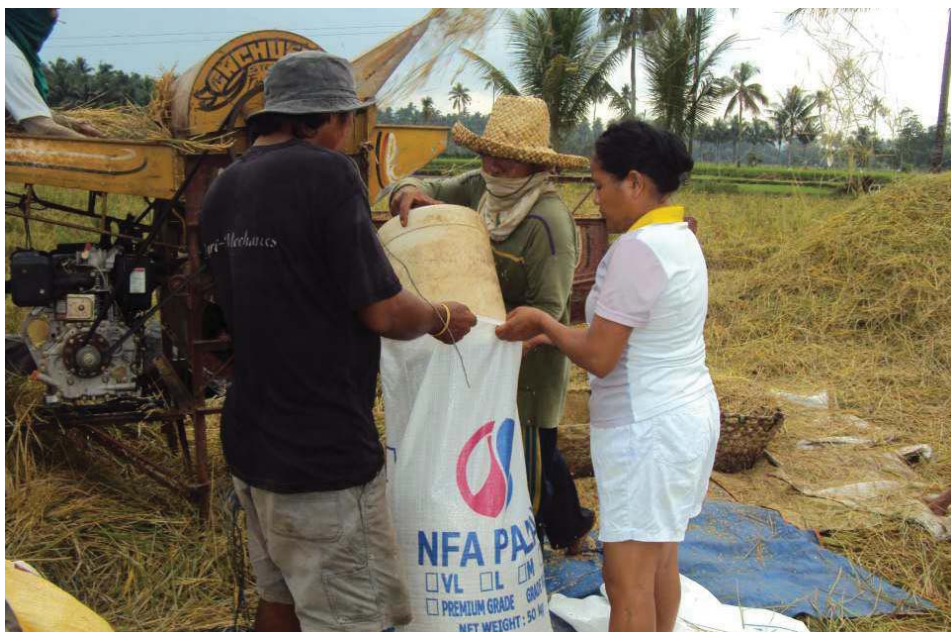
PROCUREMENT. Palay is received for bagging right from the thresher.