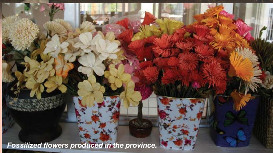
Fossilized flowers produced in the province.

mill, the provincial office is contracting private rice mills to complement their rice requirements not only for their rice distribution activities but also for dispersal to other provinces.