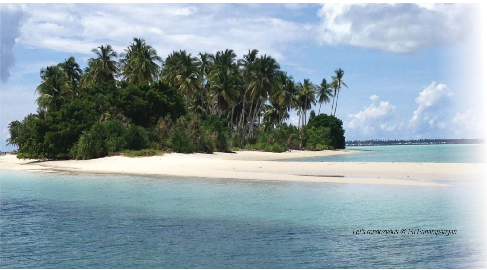
Let's rendezvous @ Pu Panampangan