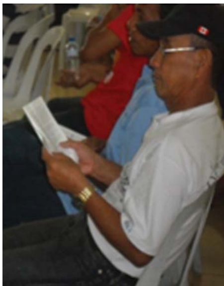
A farmer in Lucban, Quezon reading procurement leaflets distributed by NFA Quezon.