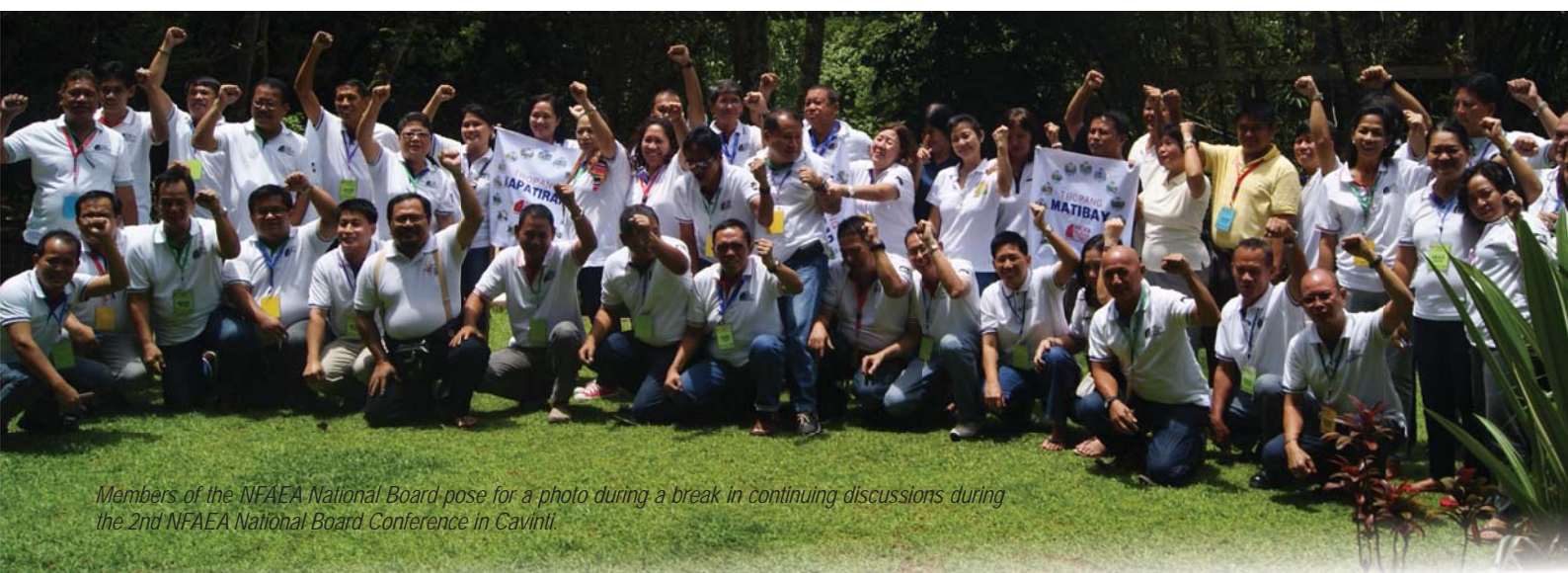
Members of the NFAEA National Board pose for a photo during a break in continuing discussions during the 2nd NFAEA National Board Conference in Cavinti.